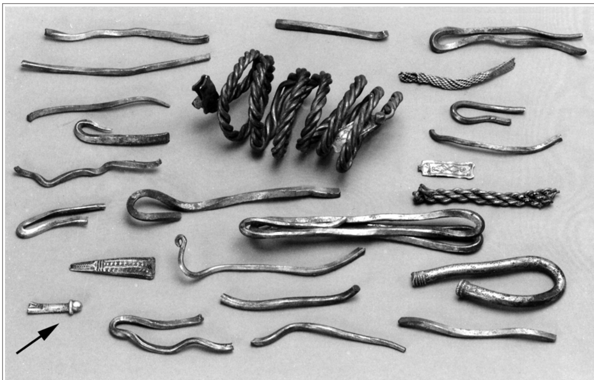
Fig. 2. The heaviest silver bundle from Oksarve when opened.