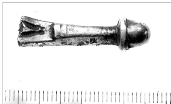
Fig. 3. One of the terminals of an East Baltic silver dress pin with a triangular-shaped head (scale 2:1;).