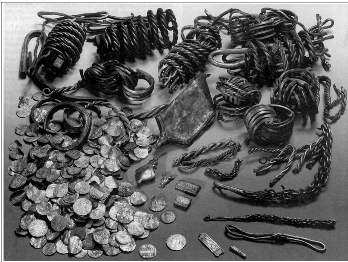
Fig. 1. The Oksarve hoard of 1997 (in the custody of the Statens Historiska Museum 33128), now exhibited in Gotlands fornsal, Visby (after Thunmark-Nylén 2006).